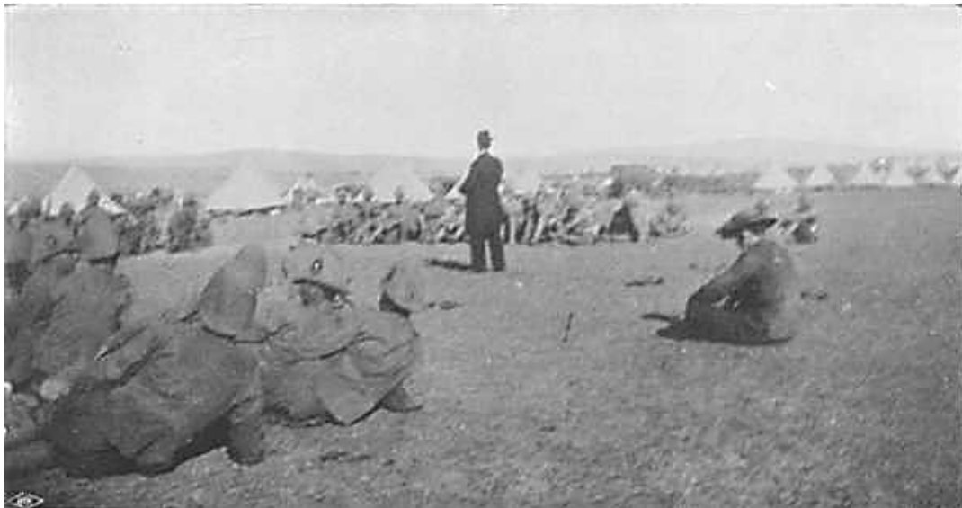
MORNING SERVICE ON THE VELDT

The pens, ink, and paper, provided free, were a great boon to the soldiers. From three to four hundred sheets of paper per day were given to the men, who, of course, had to make special application for it.