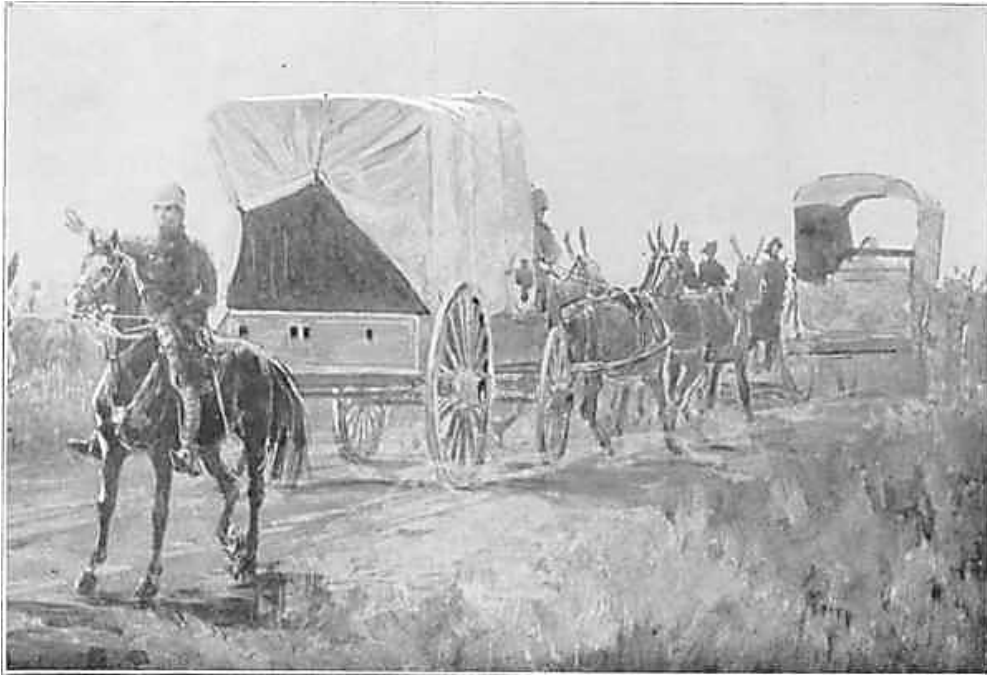
AMBULANCE WAGONS ON THEIR WAY TO THE FIELD

and were going to send them to Pretoria. But just at that moment a native came in with a note from the senior medical officer, asking that surgical necessities be sent at once, for many of the wounded were seriously hurt. After much parley through the telephone with headquarters, it was at last decided that the things be sent at once, and if I were willing that I should be the bearer, for the Boers were more likely to respect "the cloth" than anything else; also by previous visits I had become known to many of the burghers. So forthwith I started upon what many said was my way to Pretoria, and on reaching the enemy, truth to say, it looked very much like it. They were furiously angry, and I was made to join the little group of doctors, bearers and wounded, who, under a strong guard, were sitting and lying under the shade of a tree.