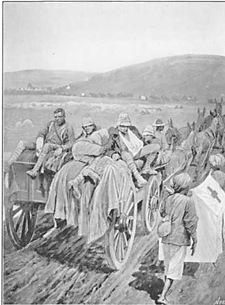
BRINGING BACK THE WOUNDED

The day for parade services had gone by, and all days were now the same; but there was other work the chaplains could do, and this they attempted to the best of their ability.