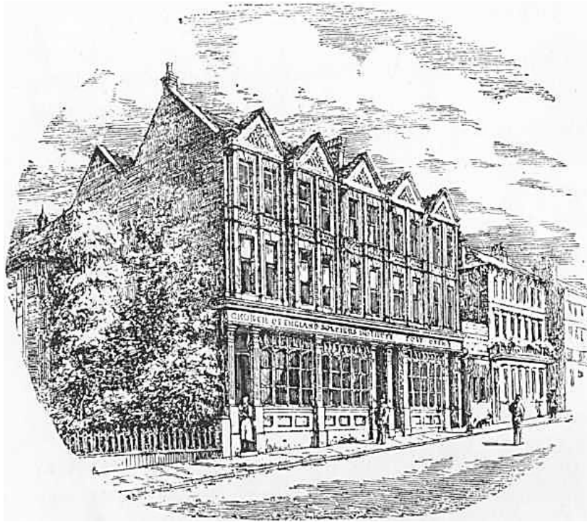
CHURCH OF ENGLAND SOLDIERS' HOME, ALDERSHOT

it would be impossible to imagine. Long 'lines' of huts, planted in a wilderness of gorse, heather, and sand, dimly lit, and miserably appointed; 'women that were sinners' prowling about the outskirts, and gradually taking possession of much of the hastily-constructed town, with the usual accompaniment of low public-houses and music-halls—such, to a great extent, was Aldershot at the beginning.