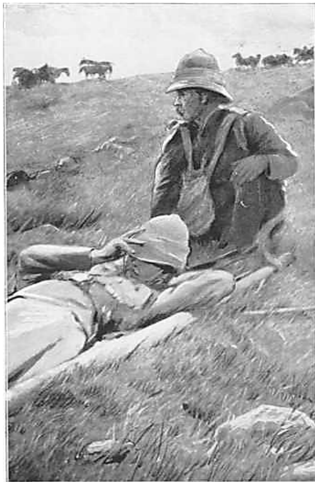
AMBULANCE WORK ON THE FIELD

And so through blood and fire, over heaps of slain, General Sir Redvers Duller passed into Ladysmith—passed in just in time; passed in to see men with wan cheeks and sunken eyes—an army of skeletons; but passed in to find the old flag still flying.