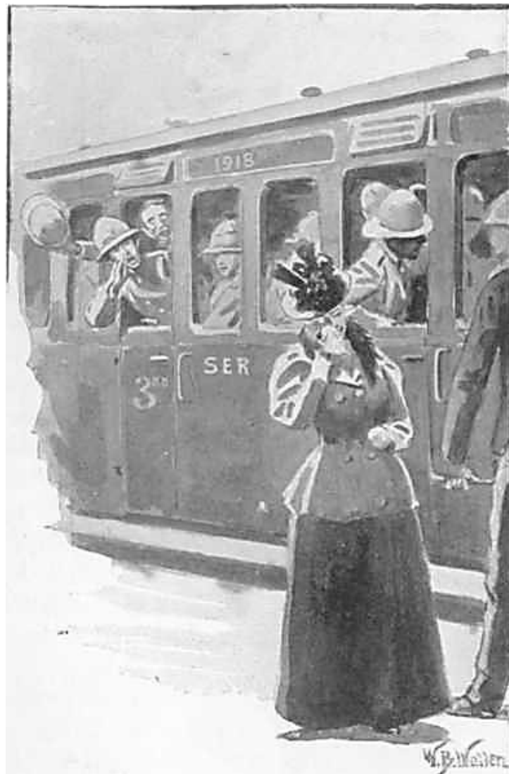
OFF TO SOUTH AFRICA

those left behind are left desolate for life. God help them, our British soldiers—aye, and God help those they have left behind them!