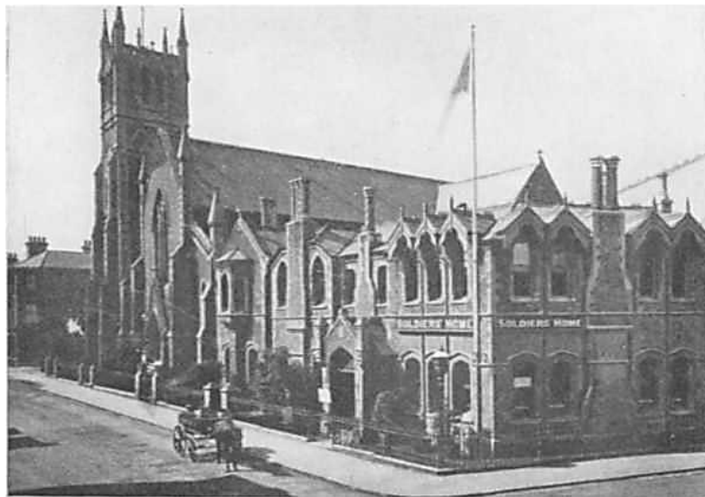
GROSVENOR ROAD SOLDIERS' HOME, ALDERSHOT